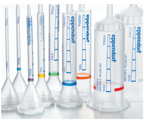
Individually color coded

Unique funnel geometry prevents damage to gloves and ensures comfortable handling