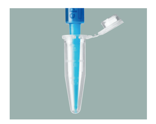
Elongated tips (for 2.5 mL, 5 mL and 10 mL)

Quick identification of the desired Combitips facilitates the workflow (color coding is also visible on packaging!)