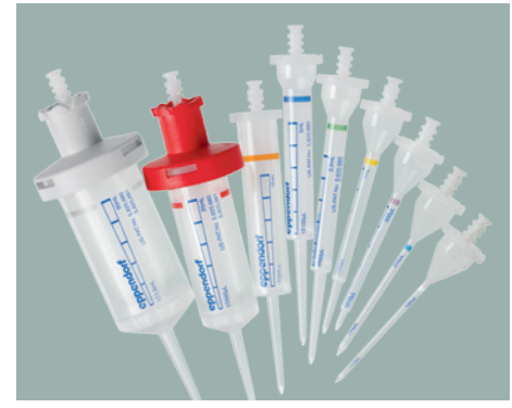
Made of virgin polypropylen.

Visibility of liquid volume using optimized graduations